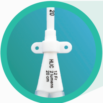
ROTATING SUTURE WINGS for secure external anchoring