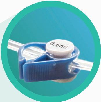
CLAMP INSERTS indicate priming volume